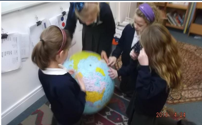
Class 3 Geography