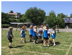
Team games in PE