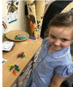
Gracie making bonds to 10.

rotate symmetrical Inuit prejudice stalking