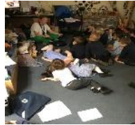
After a busy day we relaxed and listened to/played the Temple Drum.

L-MJ, "I'm a British nurse like Florence Nightingale. I've just given them mustard and now they are happy!"